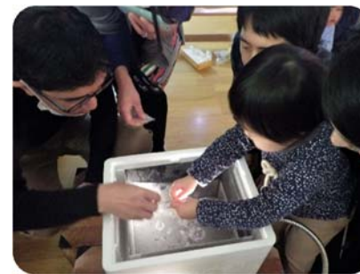
*Exciting Day: Ice Experiment by guardian's planning