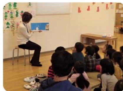
*Picture-book reading by local volunteers