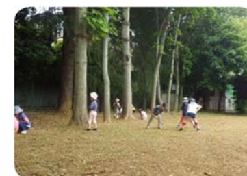
*Play in the open space on campus