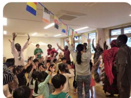
*Exchange meeting with visitors from Midwest Africa