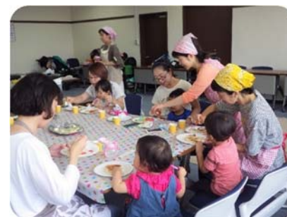
*Make snacks for children to enjoy: parents and children in the community participate (Child-rearing support project)