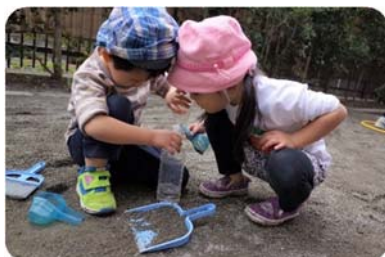
*"Is it possible to pour in?" 2 years old children playing with water