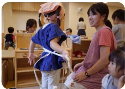
*A teacher who catches the thinking and feelings of children.