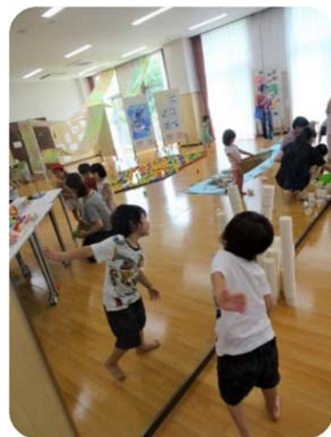
*Three-year old children who feel the art space with their bodies