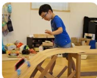
*A 5-year old child who makes a car and runs