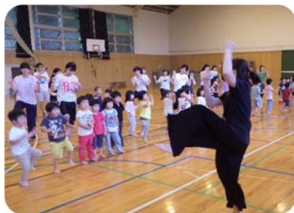
*Gymnastics – teaching with simulations