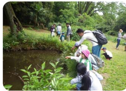
*Family excursion: Look at the same thing and share inspiration