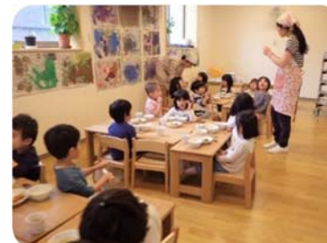
*Lunchtime in the center for ECEC